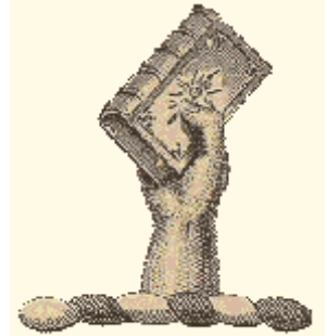
Men of Faith