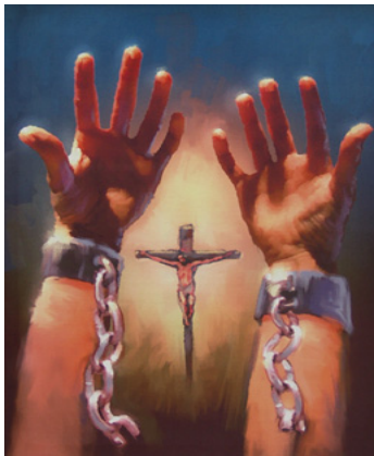
JESUS THE LIBERATOR